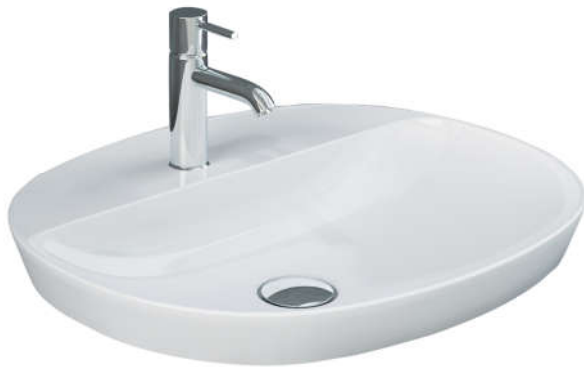
Faucet not included