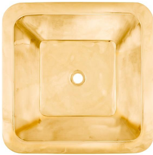
Shown in PB