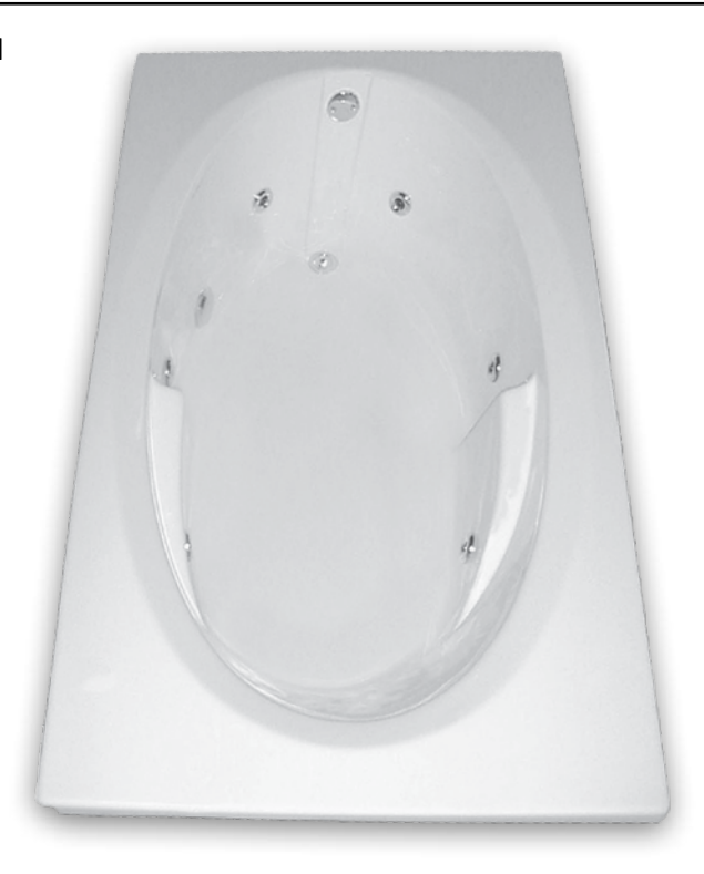
Model 6027 (Shown with trim upgrade and Lift and Turn drain)