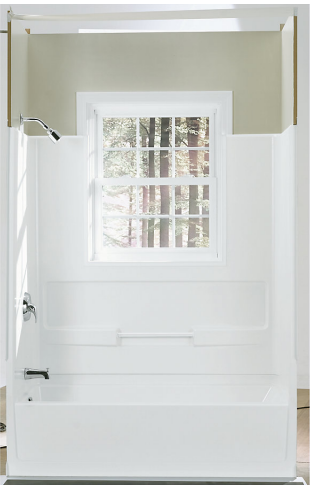
Codes/Standards None Applicable

STERLING® Warranty - Bathing & Showering Accessories See website for detailed warranty information.