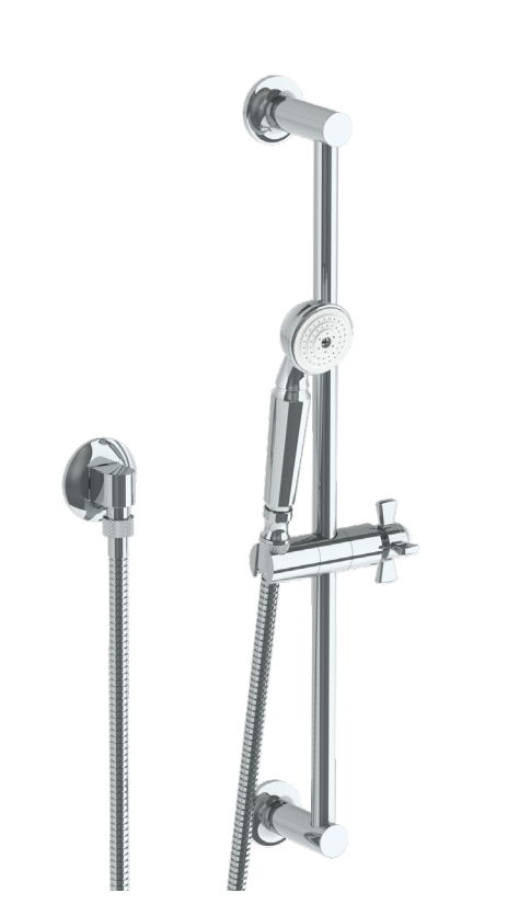
Available in all finishes shown on the Watermark Designs website